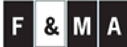
Film and Music Austria